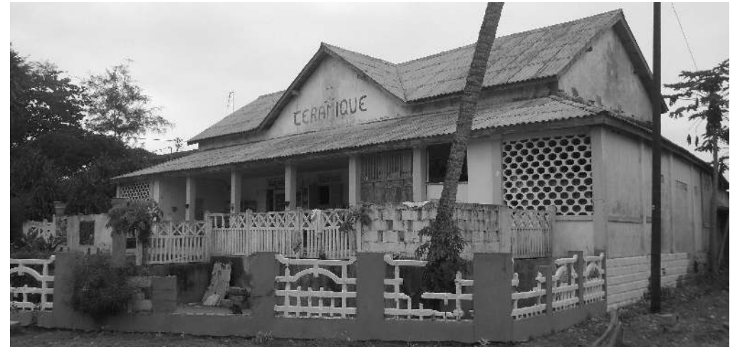
Centre céramique de Grand-Bassam

As a seaside resort, Grand-Bassam has a lot of assets to attract tourists and international events.