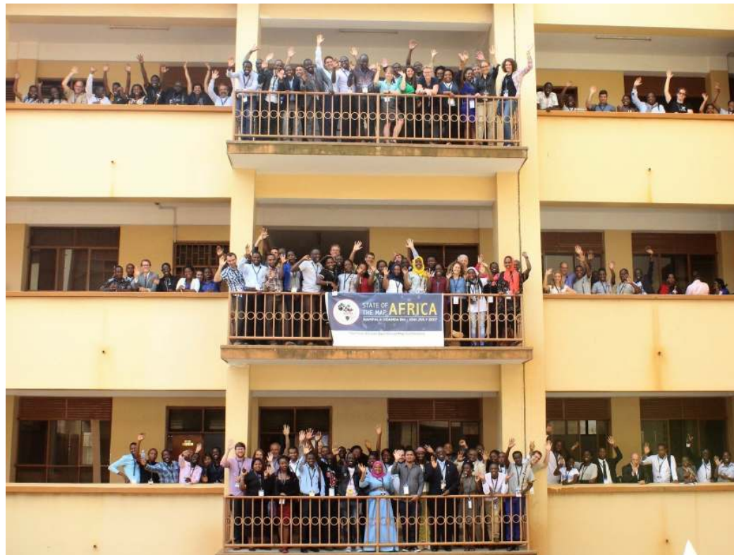
SOTM Africa, Kampala, Uganda - July, 2017

The SotM Africa scholarship program is managed by the State of the Map Africa scholarship committee which collaborates with the Budget and Fundraising committee to raise funds for the scholarships. The scholarships given are meant to cover the costs of selected recipients’.