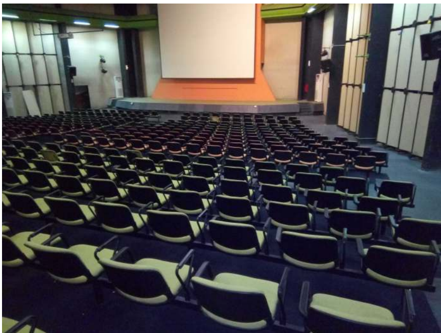
Room at VITIB

With its modern infrastructures and its 600 people capacity, the VITIB will be a great place to rule the next SOTM Africa, which is a showcase event of the OpenStreetMap and communities of practice in Africa.